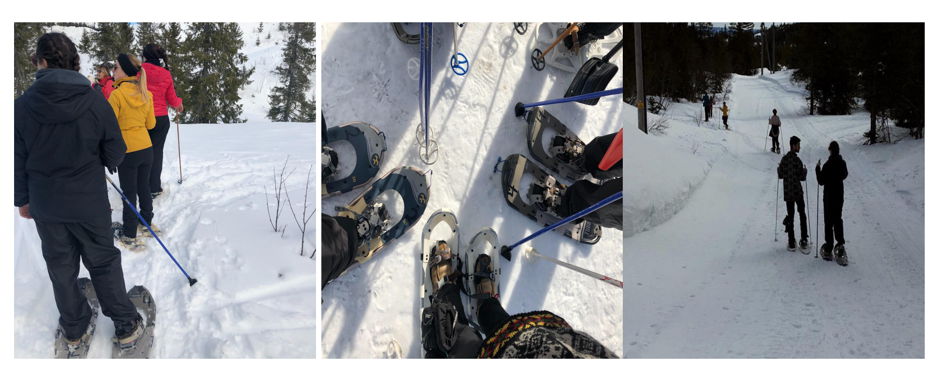
WE WALKED AROUND THE MOUNTAINS WITH SNOW SHOES, LEARNING ABOUT THE NATURAL ENVIRONMENT IN TELEMARK